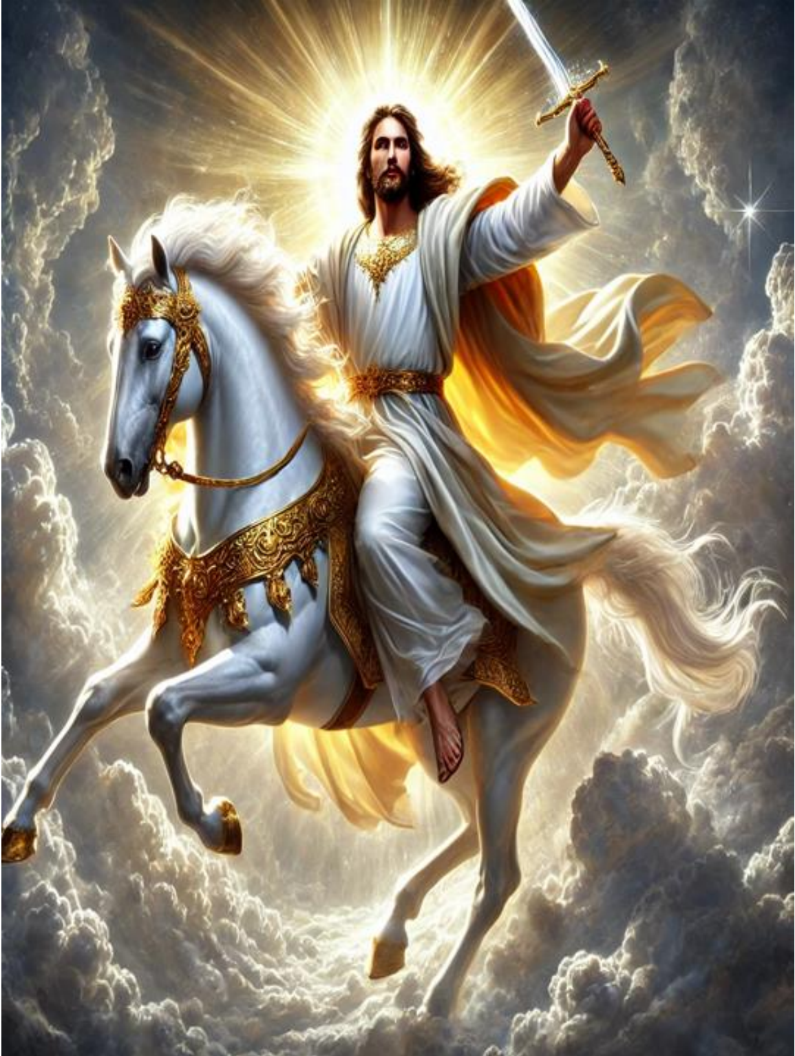
Revelation 19:11: Rider On The White Horse; King of Kings & Lord of Lords!